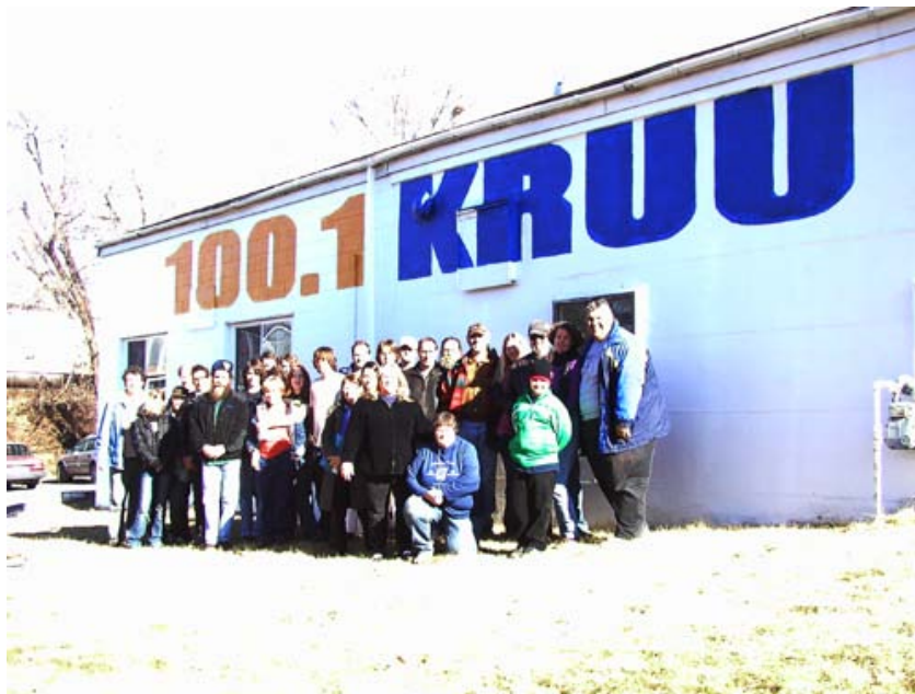
A group of KRUU volunteer hosts outside the station at 405. N. 2 nd St.

KRUU grew out of a Community Youth and Technology project called the Beatbox that operated in Fairfield from 1999 until 2003. Inspiration, equipment, core volunteers and our building are carryovers from the Beatbox project, and have been instrumental in the creation of KRUU-LP.